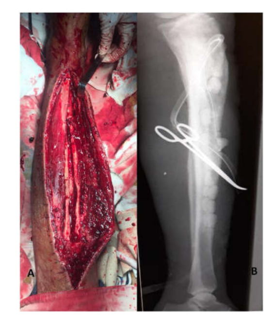
Fig 2. A: Anterior cortical resection. B: Osteoclysis system and PMMA medicated with amikacin

In the first stage, an anterior linear hemidiaphysectomy is performed up to the proximal region at the metaphyseal level with resection of sequestered bone tissue up to the region of the anterior tibial tuberosis, medullary evacuation of said anatomical region, obtaining abundant fetid yellowish secretion, scarification of the medullary canal until tissue is obtained. bleeding bone, amikacin-medicated cement beads were placed in the medullary cavity and intramedullary osteoclysis system for irrigation with 100ml physiological solution plus 1g of vancomycin every 24 hours for 10 days (Humm et al., 2014) (Fig.2). In the second surgical stage, the non-vascularized free fibula is taken, the fibula is obtained with the desired length and it is presented in the exposed medullary canal, fixation and stabilization is carried out with 4.5 titanium screws with the placement of 4 of a standard 30mm measurement. Subsequently, the bioactive glass is placed in interface areas between the stabilized fibula and the posterior cortical bone of the tibia along its entire length, as well as the total filling of the medullary cavity in the metaphyseal region (16 grams of 1mm bioactive glass were used), the surgical wound is closed, and remains hospitalized, amikacin 250mg every 12 hours and Moxifloxacin 400mg every 24 hours are applied.