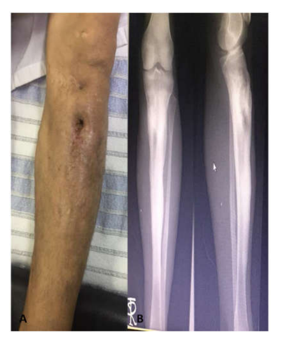
Fig. 1. A: Fistulas in the proximal metaphyseal region. B: AP and lateral radiography of the left tibia, lytic area in the tibial metaphyseal region and anterior bone condensation up to the distal diphyseal region

surgical toilets on three occasions and the application of multiple antibiotics for prolonged periods without improvement. Physical examination: presence of fistulas in the proximal metaphyseal region 1 cm in diameter, both with communication to the spinal canal and with active, purulent and fetid exudate. Paraclinical Hb 13mg/dl, HTC 30%, Cr 2.3mg/dl, Urea 40mg/dl, culture of E. coli wound exudate sensitive to moxifloxacin and amikacin, anteroposterior and lateral X-ray of the left leg showing anterior cortical condensation from proximal metaphyseal region to the distal third of the tibial diaphysis with the presence of a lytic zone of approximately 3 cm in the proximal metaphyseal region. After these findings, it was classified as chronic tibial osteomyelitis type IV B according to the host with added systemic disease chronic renal failure (CRF). Definitive surgical treatment in 2 stages was chosen (Fig. 1).